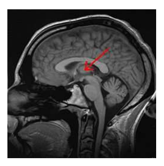
FIGURE 3. Thalamus in the Human Brain.

This explains why we can find octaves in cultures all over the world even though their music may sound very different. Even though all cultures share octaves, there are many ways to divide the octave into smaller intervals. We call those choices scales. In modern western culture, the major and minor scale are the most prominent scales. For example the C major scale corresponds to the white keys on a piano. Notice that on a piano you have to go up or down 8 white keys to travel an octave (starting on a white key and counting this first key as one of the 8).